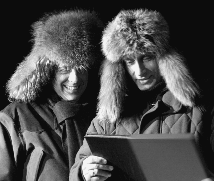
Silvio Berlusconi and Vladimir Putin in Zavidovo, Russia, February 2003.